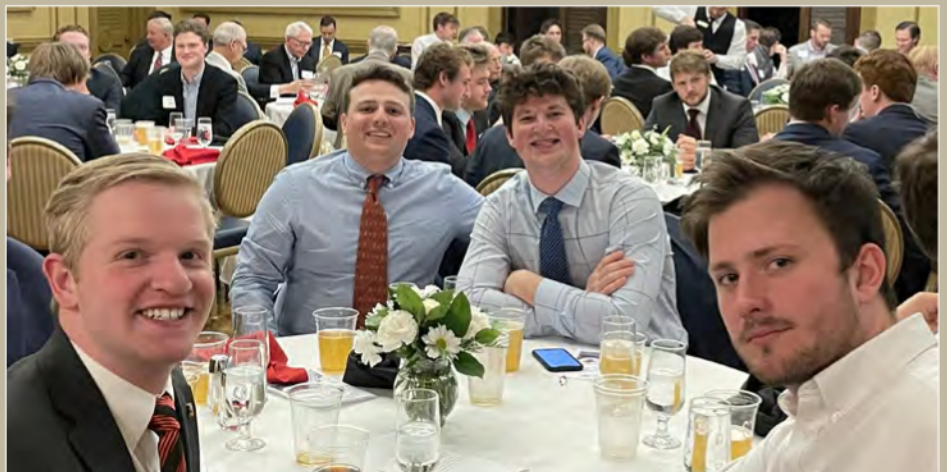
2023 Alpha Xi Founders' Day Banquet.