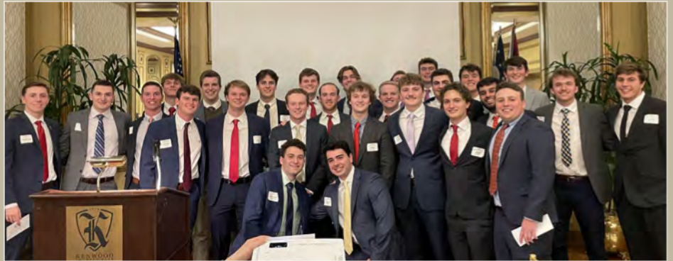
2023 CE&CF award recipients.

This year, 91 Brothers attended our 2022 Christmas Luncheon on December 3 at Kenwood Country Club. On February 23, 2023, we returned to Kenwood for our annual Founders' Day Banquet, where 130 Brothers celebrated the 155th anniversary of our beloved Fraternity. This year 36 CE&CF and five Pike Memorial Foundation awards were presented totaling $57,500. Our annual "UC Bearcat" scholarship was awarded in September, making the grand total of awards $59,000 for this fiscal year!