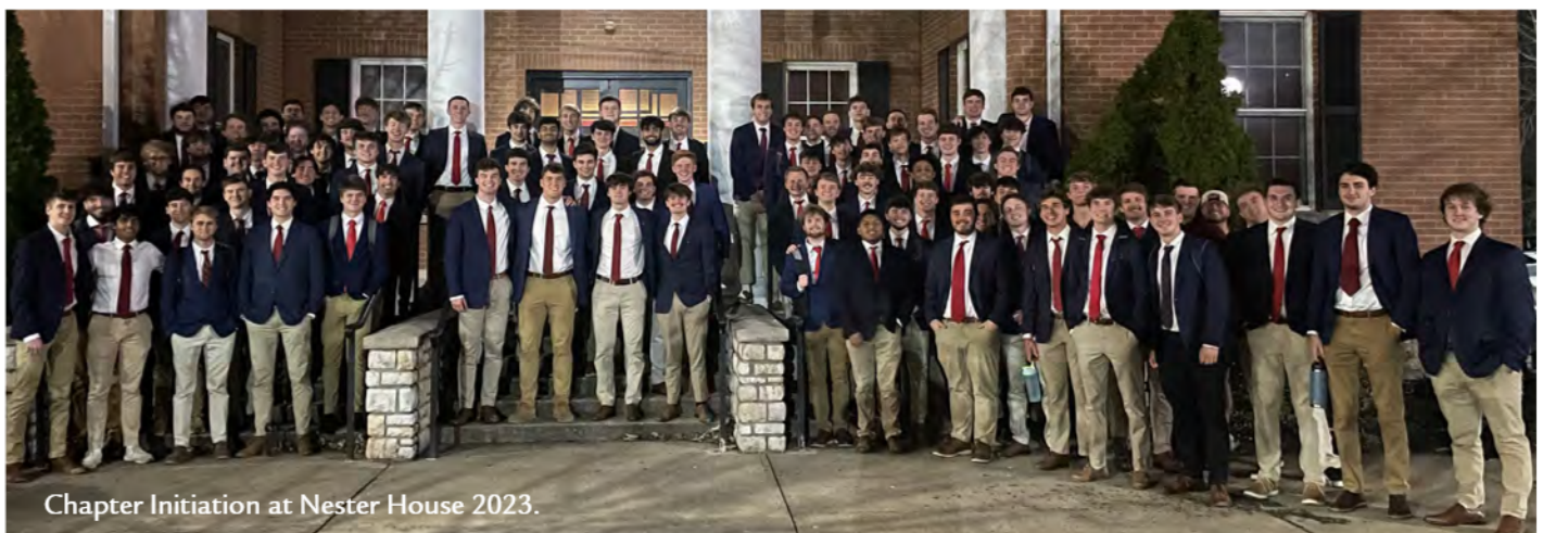
Chapter Initiation at Nester House 2023.